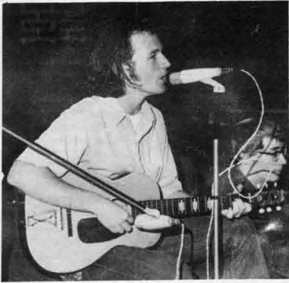
Photographs for the Current taken by Miracle Photography, Inc. "If it's a good picture. . . it's a Miracle!"