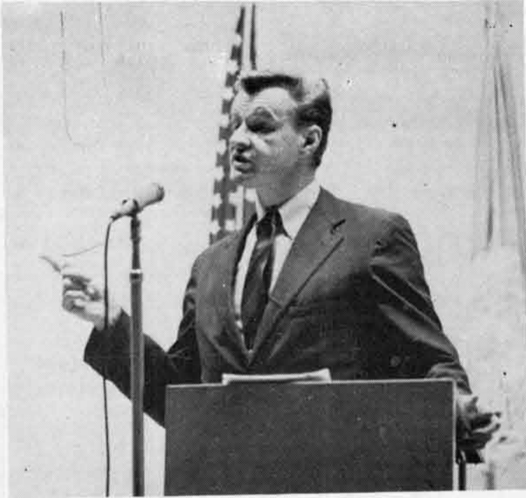
Soviet expert Zbigniew Brzezinski.

Brzezinski is author of almost a dozen books, which are mainly over the Soviet political system, and teaches government at the University of Missouri at Columbia.