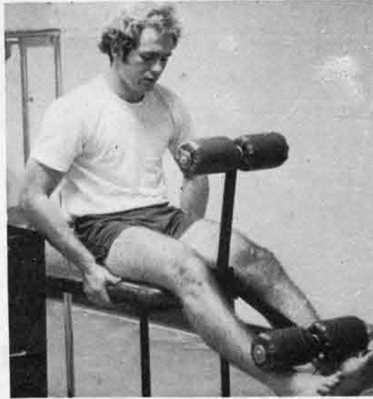
The training room in the new fieldhouse has become one of the most popular facilities in the building. The room contains weights, an exercycle and assorted tools of self-punishment.

The Rivermen will have to venture once more into Illinois this Saturday when they meet SIUE's Cougars in the corn fields on the east side campus. Also running in the meet will be the Chikas of the University of Illinois-Chicago Circle.